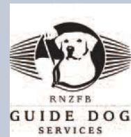
Principal Sponsor of RNZFB Guide Dog Services