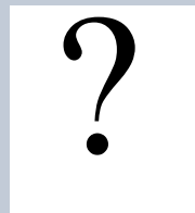
Thinking of a change?